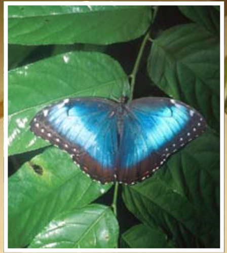
Visit our Butterfly Sanctuary to view the exotic Blue Morpho butterfly as well as other exotic species.