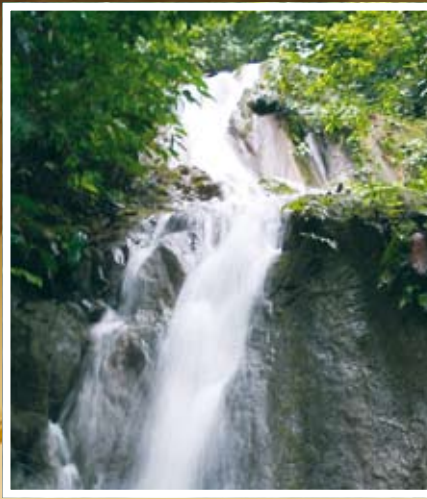
Walk through a wild rainforest or cool down in one of the many local waterfalls.