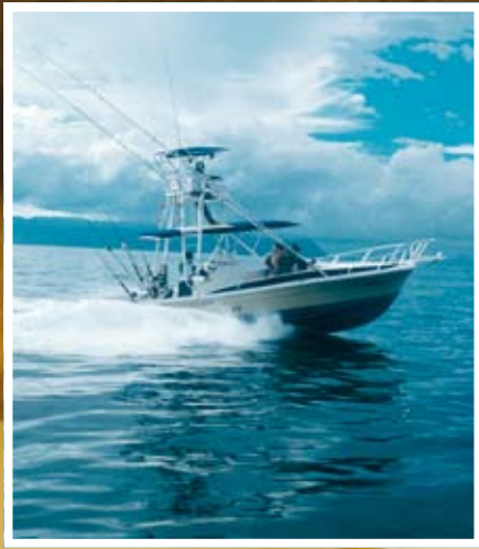
Golfo Dulce tours by boat.